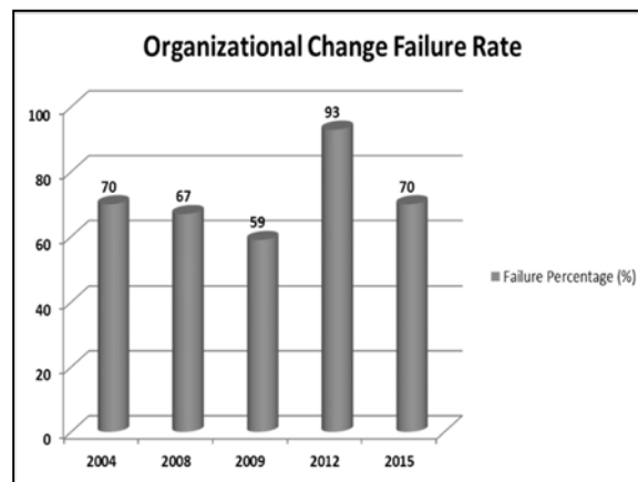
Fig.1. Organizational Change Failure Rate. Year 2004, 2008, 2009, 2012, 2015.